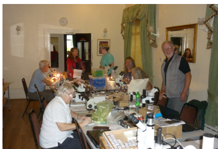
“Microscope Room 3” with the gang hard at work