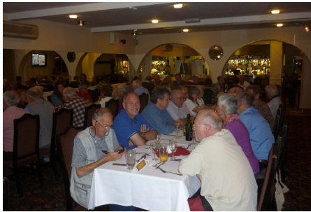
Delegates enjoying a social evening and meal in the Stoneycroft

leaving the hard core to sample the delights of various single malts and some super-strength Russian vodka.