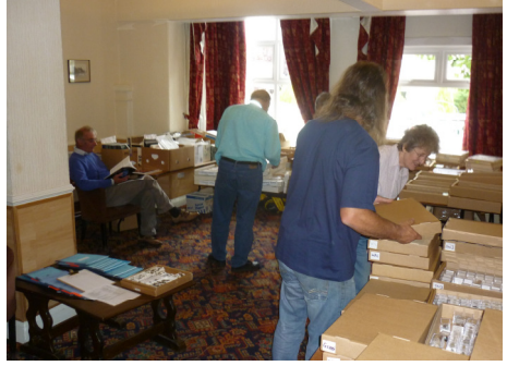
The hotel lobby sales area—bargains galore apparently!