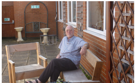
The Chairman finds a quiet moment to take a break in the fresh air