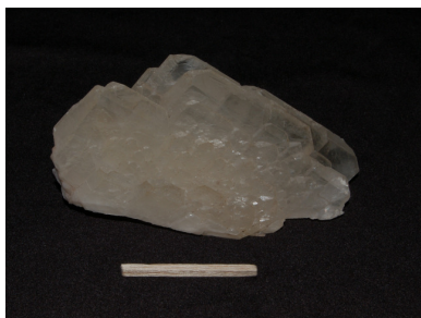
Specimen after soaking in a solution of Vitamin C