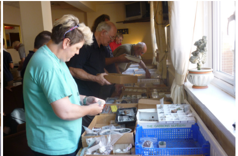
Lots to look at on the sales tables