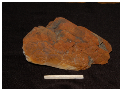
Specimen before treatment