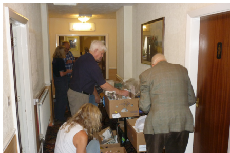
Frantic activity around the “Grab Table” - it is amazing what people find attractive when it is free”

This year there was a great deal of material for sale and on the grab table (largely from the collection of the late Mary Hyde of Cheltenham), and a large selection of books and magazines too.