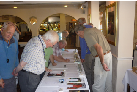
Competition was fierce on the Silent Auction tables

The principal objective of the “silent auction” was to ensure that the number of lots in the main auction was restricted to a reasonable number, and of a much higher quality than usual. The strategy worked well, and the main auction had a much better feel to it. The proceeds of the combined auctions generated £1089 for Society funds, which is great—thank you to everyone who provided items for sale, and to those who bid for